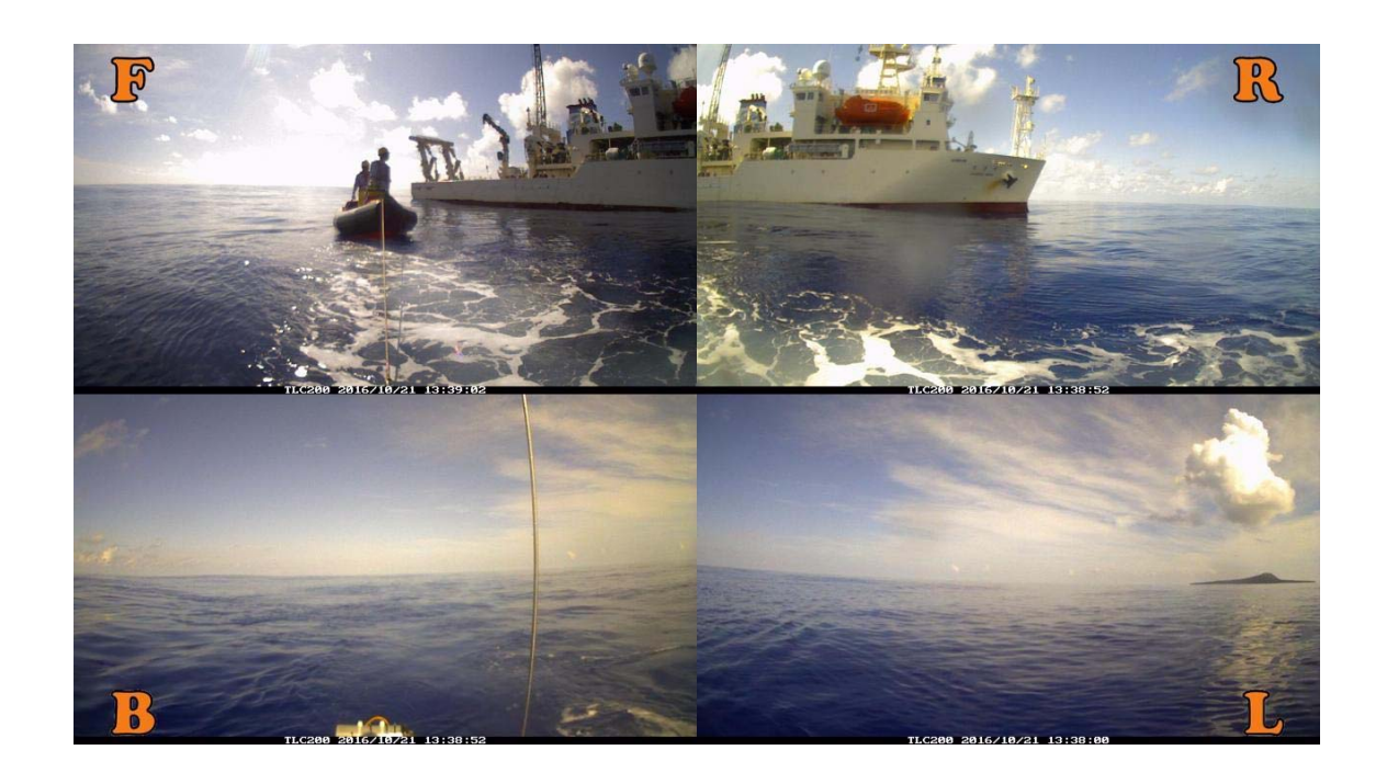
Figure 5: Images of the recall taken by the wave glider