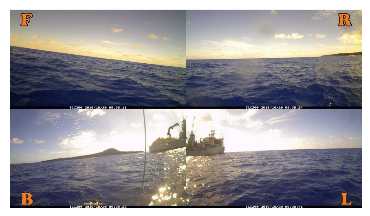
Figure 4: Photos from the WG taken directly after launch using 4 cameras (front, back, left and right).