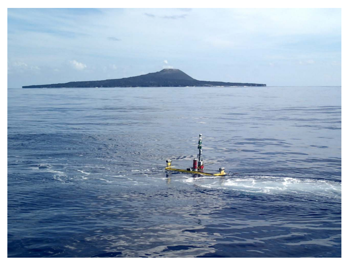
Figure 3: The wave glider after being launched and Nishinoshima